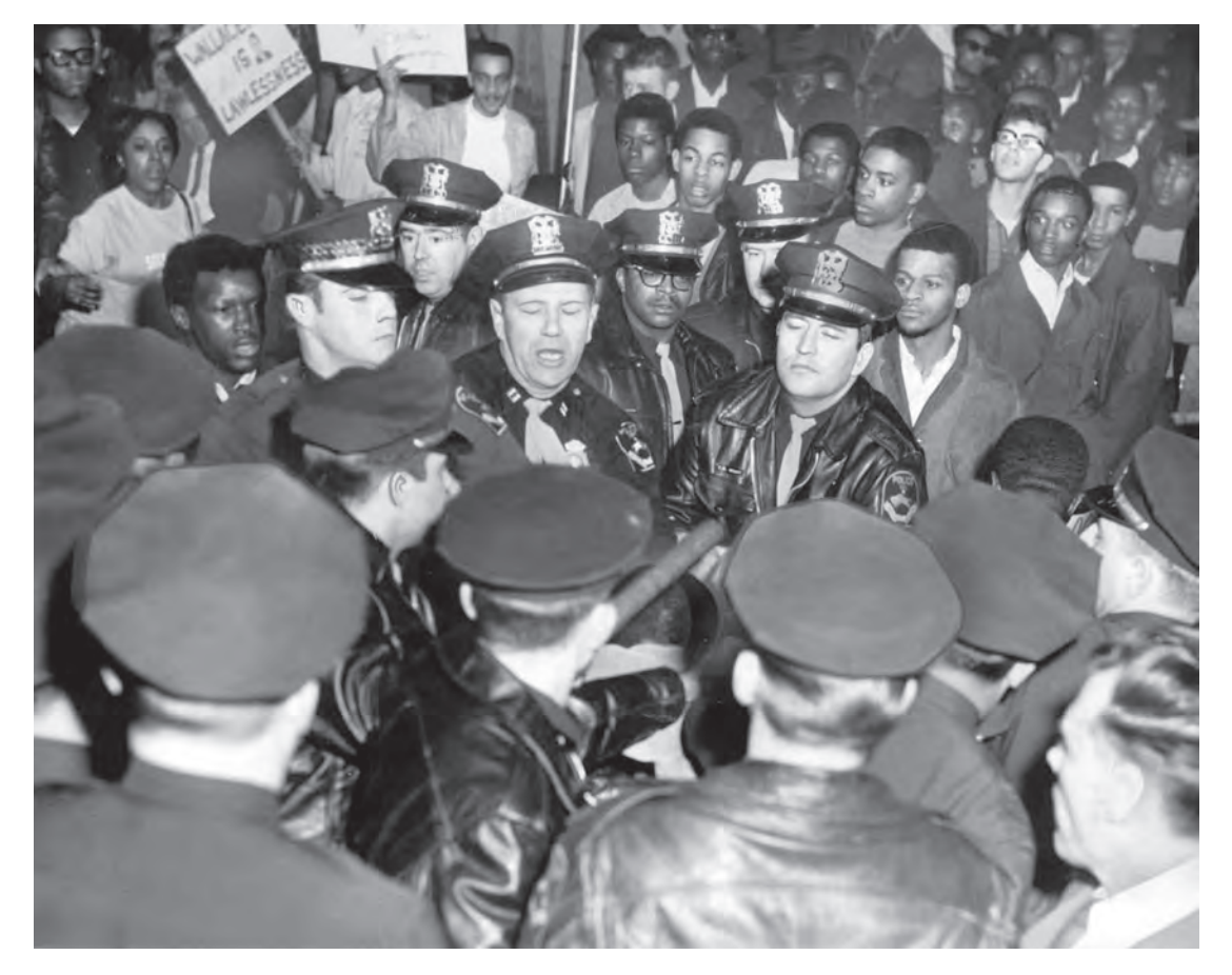
Police subdue an anti-Wallace protestor at the Omaha Civic Auditorium, March 4, 1968.