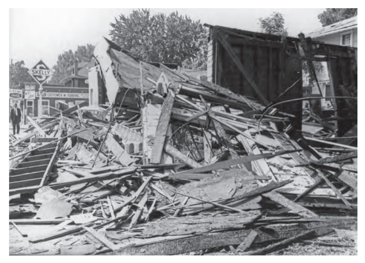
"In a second round of violence in August 1966, a fire set by an arsonist caused an explosion which leveled this café near Omaha's racially disturbed Near North Side 8/3. An adjacent service station and nearby homes were damaged." United Press photo, August 3, 1966. NSHS RG2467-24

Job prospects for young black males were equally poor during this period. In 1960, only 27 percent of black American males ages fourteen to seventeen were actively in the workforce.<sup>45</sup>